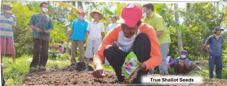
True Shallot Seeds