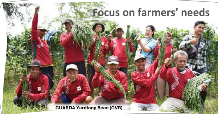
GUARDA Yardlong Bean (GVR)