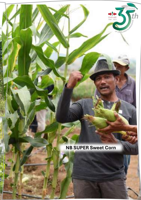
NB SUPER Sweet Corn